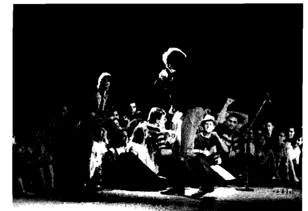
Eddie Money rocks McLane Center

They have all "been" on campus as a part of the extra curricular events at Alfred. The Performing Artists and Speakers Series, the Alfred Film Society along with other groups and societies provide over 200 programs during the year.