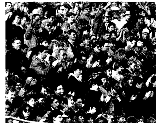
Enjoying a home football game