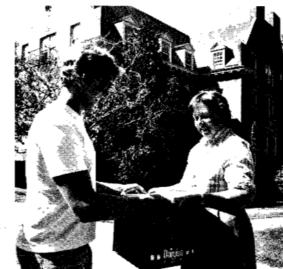
Moving day in front of "The Brick"