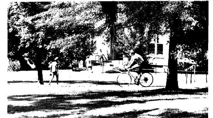
Enjoying Indian Summer

There are over 60 clubs and the list is growing! There are seven social fraternities, 3 sororities and 10 honorary societies. Something for every interest! A complete list of clubs and organizations can be found in the New Student Guide or requested at the Campus Center desk.