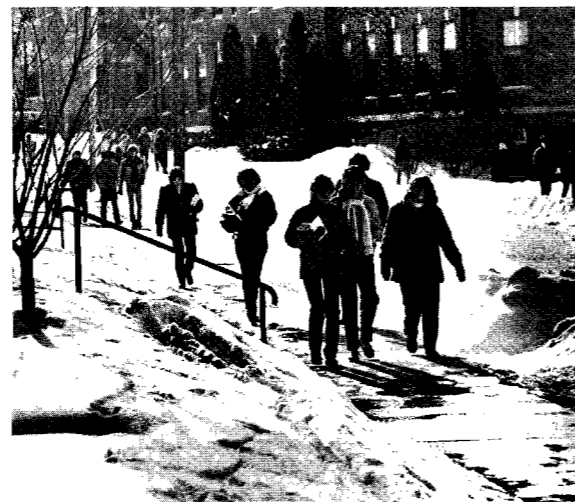
Mixture of clouds and sunshine, 50% chance of flurries, temperatures ranging from 20 to 35 degrees (fahrenheit)

Brrrr! Winter is real in Alfred, but snowfalls tend to be moderate and though warm clothing is a must, the season also is excellent for skiing at nearby winter recreation areas. Rain gear is also helpful. Beautiful days abound during the fall and spring seasons.