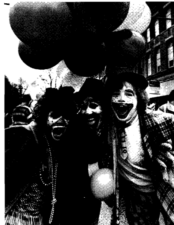
It must be Hot Dog day