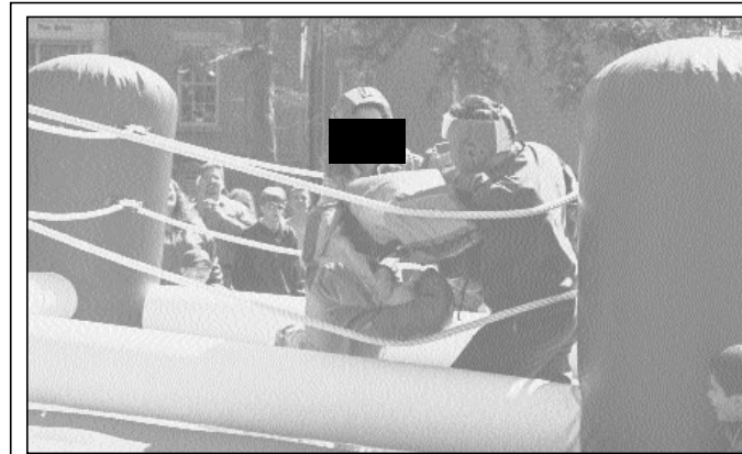
The Saxon boxing team did well at last week's inflatable tournament held at St. Bonaventure. Here, an AU boxer puts a member of the University of Rochester team on the ropes. The AU boxer would score a technical knockout later in the round.

With any luck, they may return two weeks from now with first place in their possession. □