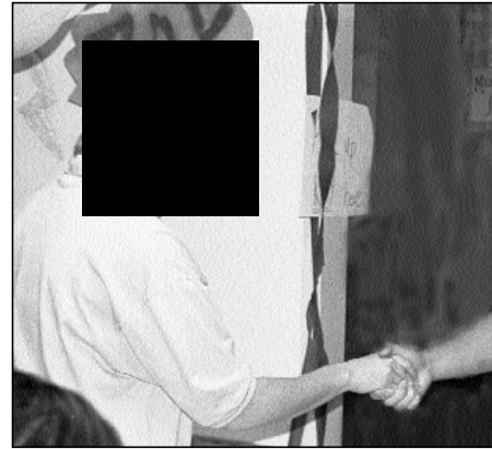
Communist officials have been signing up students by the dozen in the SOS. Here, a student is welcomed to the group after taking an oath.

Officials assured students and staff that detailed investigations will continue and there is no need for panic. Comrades are still at large. ★