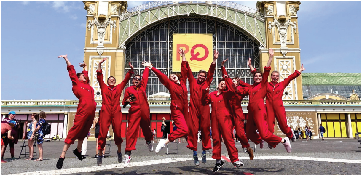
Prague Quadrennial.