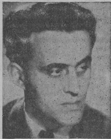
Igumnov and Professor Neuhaus at the Moscow Conservatory. When