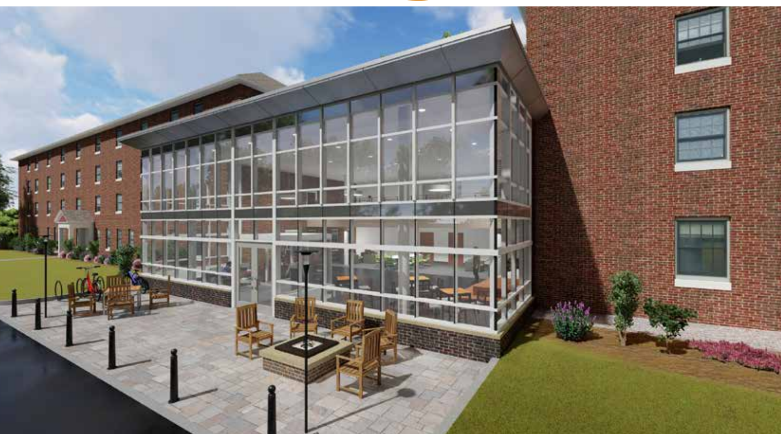
Architect's rendering of the new Moskowitz-Tefft halls project.