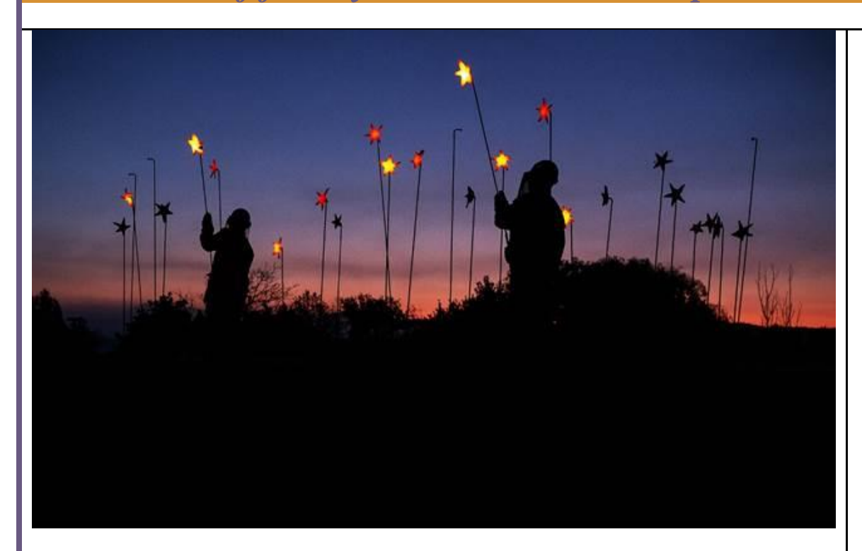
Lambert's Starry Starry Night Photo

A newsletter of faculty activities and accomplishments