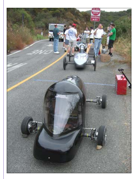
"Primal Impulse" - ready to race!