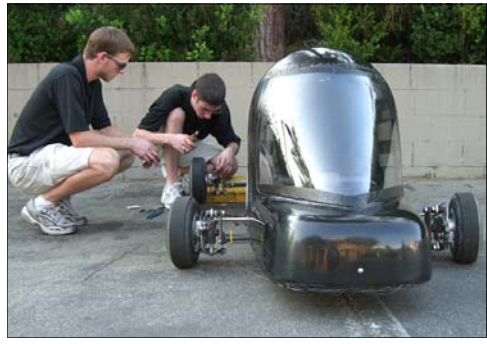
Peifer repositioned the axles to alter weight distribution after test runs on the California course. Total weight (car + driver) was restricted to 350lb.

persistent braking problem to get in four runs with Hanes reaching a top speed of 56 MPH and turned in a course time of