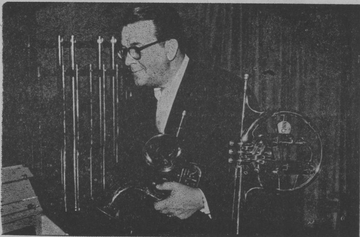
Band leader Richard Maltby will bring his orchestra to Alfred Friday evening to play at the IFC Ball.

To cite Maltby as an innovator, one need only mention such solid hits as "St. Louis Blues Mambo," which practically started the standard-to-mambo-beat fad, or "Theme from the Man With The Golden Arm," which preceded by a number of years the current boom in motion picture theme song recordings. The Richard Maltby Octet is a nucleus of the big band which can also act as a separate entity. Consisting of only reeds (4 reed