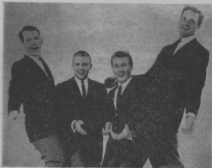
The Four Preps will perform Saturday afternoon at 1:45 in Alumni Hall as feature attraction of IFC Weekend.

Since high school days, the Preps have appeared on many television shows, among them the Ed Sullivan Show and the Ernie Ford Hour. Their college appearances have taken them to every state of the union. In addition, they have played almost every major state fair in the country and all of the top night spots, including Los Angeles' Cocoanut Grove, Hollywood's Crescendo, Reno's Riverside Hotel, San Francisco's Facks II, the Dune Hotel