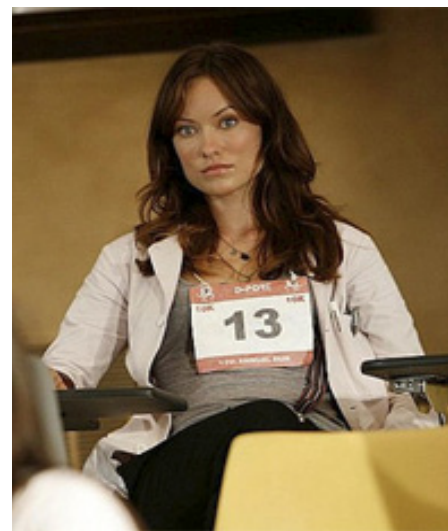
Olivia Wilde as Remy Hadley on House

From the beginning the viewer knew this relationship would eventually end, as they all do, but I wasn’t sure if it would be like House , or if it wouldn’t quite bring me to such agony. Surprisingly, I was actually not really upset about the break-up; if anything I was slightly happy. Why? Because Roxie is the one who breaks up with Angela. I thought this was a nice move on the part of the writers because Roxie was the character invested in the relationship and I felt it was empowering for her character to be the one to ultimately end it. On the other hand, I was not thrilled that Angela jumped right into bed with her former fiancé after the break-up. Though this relation-