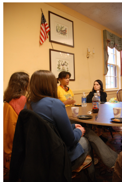
Redefining feminism at Susan Howell Hall

We split into small group discussions, ate some snacks, covered a wide variety of topics and reached some very interesting conclusions.