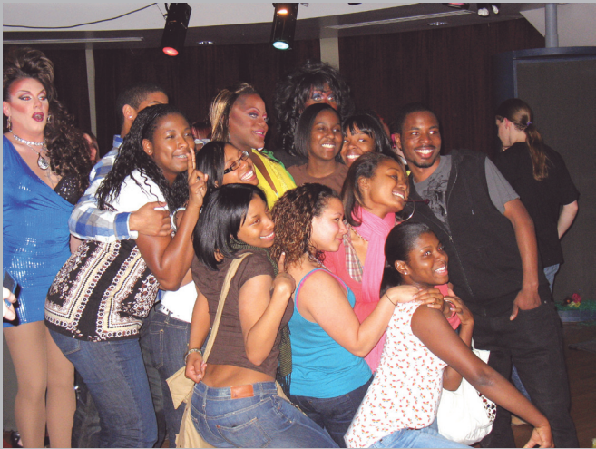
Glam Slam attendees go wild "in the jungle" of the Knight Club

Immediately upon graduating I am traveling to Australia for a month of exploration while I continue applying for jobs in the field of social justice with non-profit organizations. My plan is to apply for graduate school to earn a Master of Arts in Social Justice and Human Rights. Ideally, I would like to focus on women's and gender issues as well as LGBTQ rights, with the connection between both being sexual politics and sexual freedom.