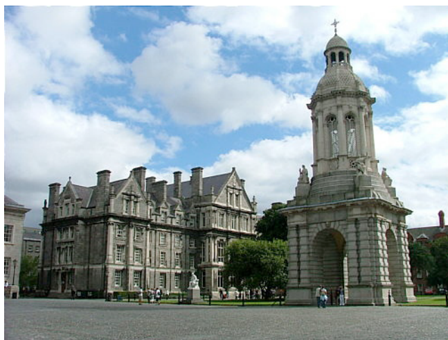
Trinity College campus, Dublin

I knew there was something wrong when I perused this semester's essay titles.