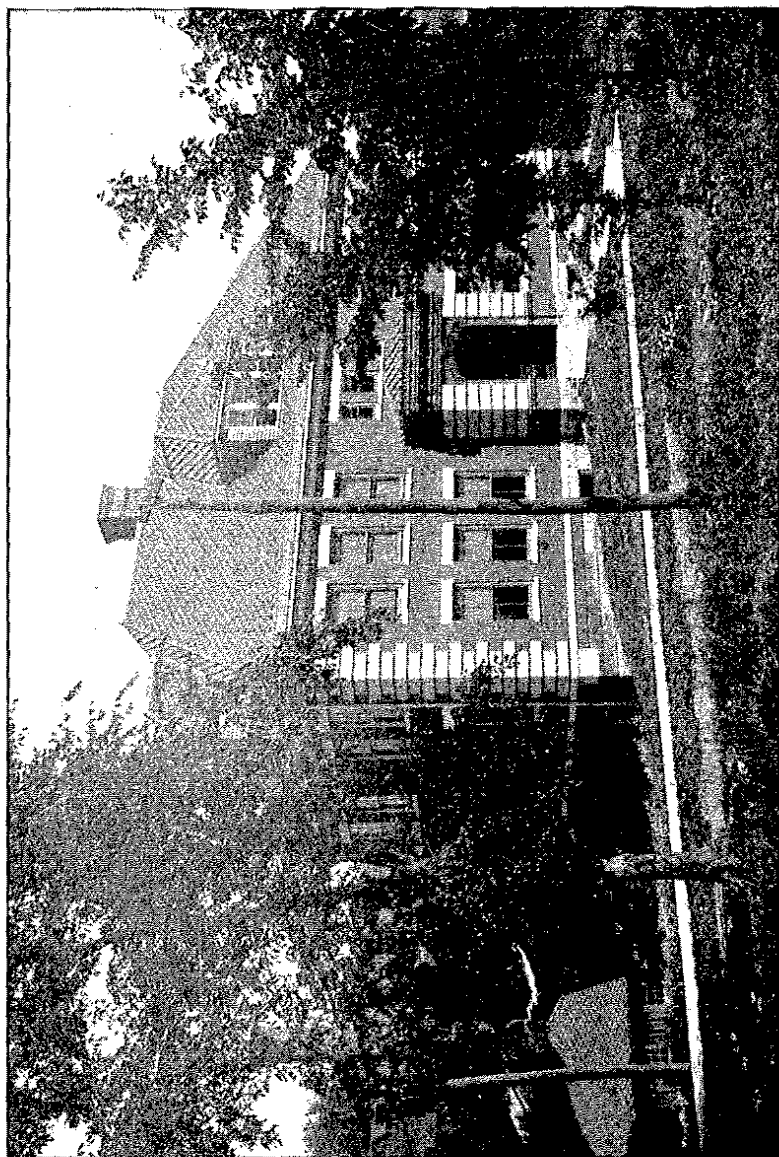
The New York State School of Clay-Working and Ceramics