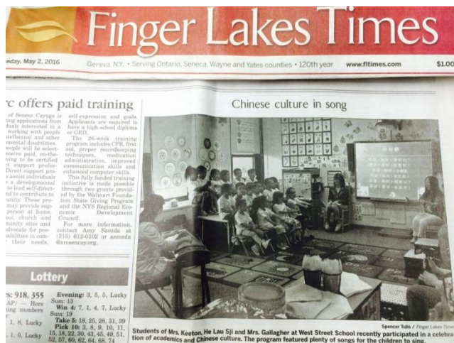
News reported by Finger Lakes Times

also invited to play the Guzheng for the students.