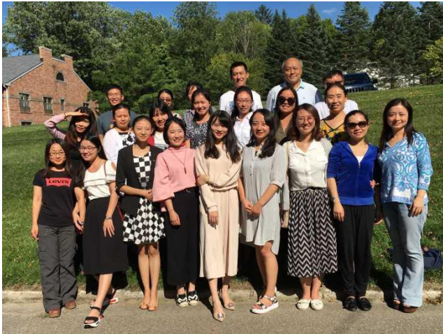
The CIAU Family

volunteers of CIAU participated in this training.