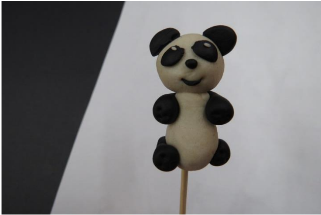
A panda made by a student

This is a type of folk artwork that is easy to make but has very high artistic value.