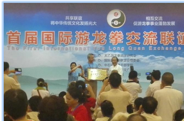
Representative of the Tai Chi class receiving an award