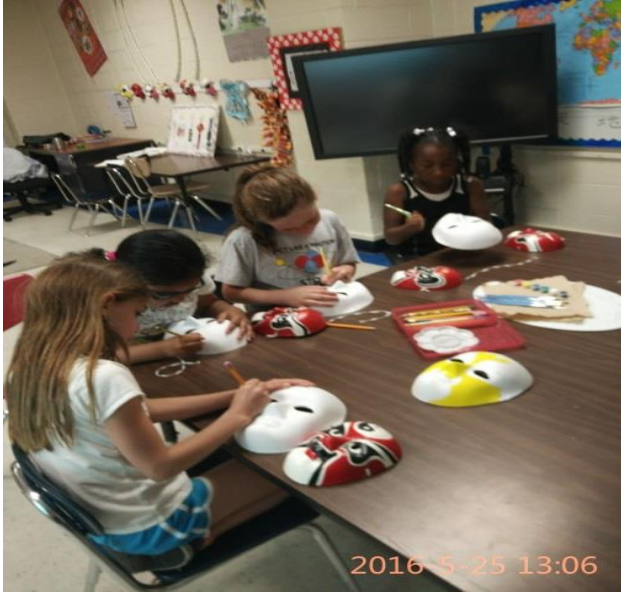
Students painting masks

Cultural teaching mainly included making cards for Mother's Day, painting face masks, weaving bracelets, and making dough figurines. Through the study of language and culture, students could fully feel the charming nature of Chinese culture and their enthusiasm for learning Chinese was strengthened, as well.