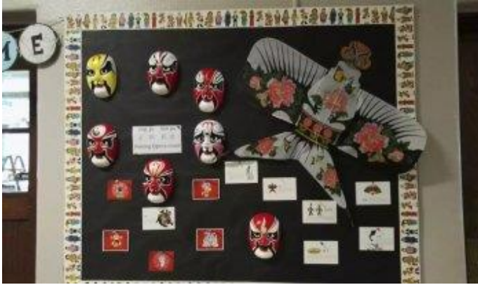
Demonstration board in the hallway