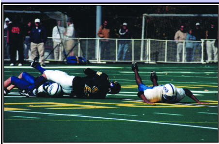
Where'd he go? Where'd he go? I just had 'im. Where'd he go?

Full of new style, Milli Vanilli is expected to go Platinum with their new Album, entitled Back Again, Bit**.