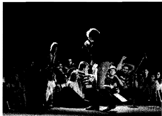
Eddie Money rocks McLane Center

They have all "been" on campus as a part of the extra curricular events at Alfred. The Student Activities Board, Nevins Theater, Performing Artists and Speakers Series, the Alfred Film Society along with other groups and societies provide over 200 programs during the year.