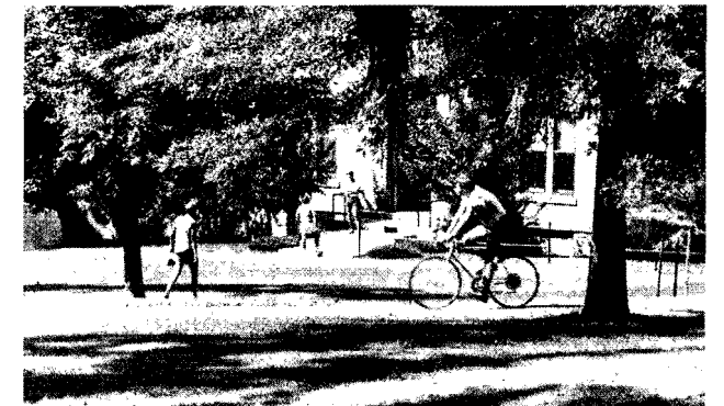
Enjoying Indian Summer

There are over 60 clubs and the list is growing! there are eight social fraternities, 4 sororities and 9 honorary societies. Something for every interest! A complete list of clubs and organizations can be found in the New Student Guide or requested at the Campus Center desk.