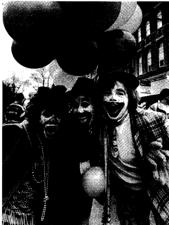
It must be Hot Dog Day

Check the listing of available jobs in the Financial Aid office. Some students find part time work in the Community.