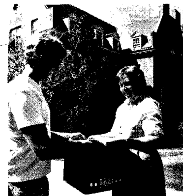
Moving day in front of "The Brick"