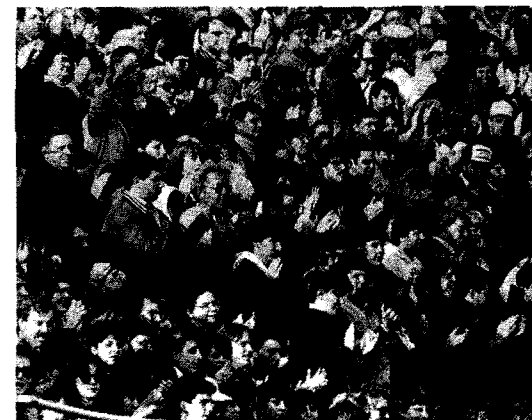
Enjoying a home football game