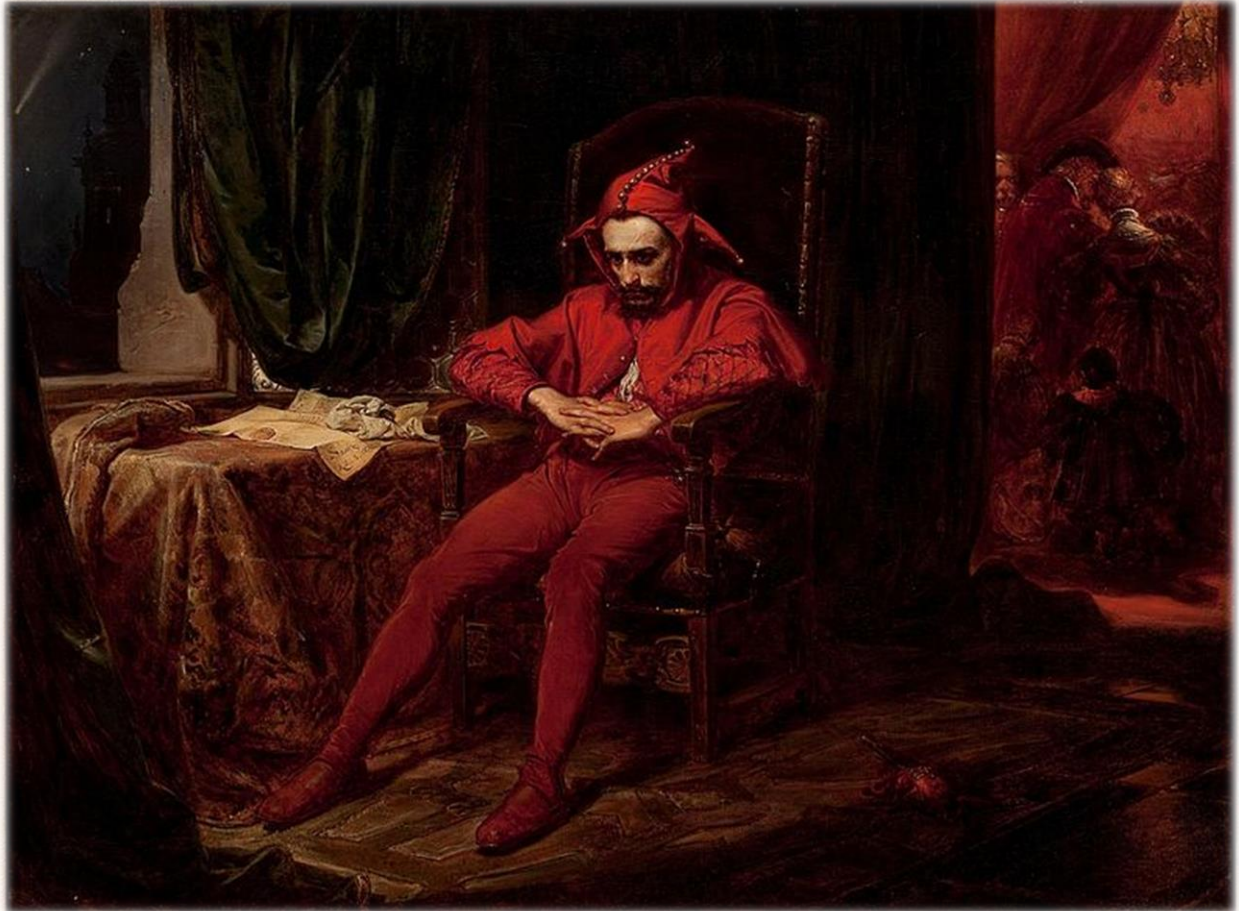
Stańczyk , Jan Melejšo, 1862, oil on canvas, 47 in × 35 in, Warsaw National Museum