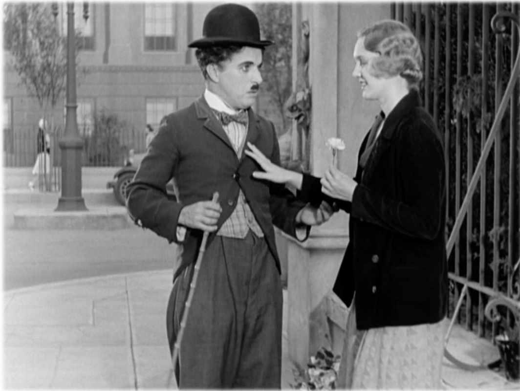
Charlie Chaplin in 1931 silent film City Lights

some argue over the necessity of an audience, these two notions are both essential to keep in mind when considering the way a clown functions. Clowns are abstractions of a human, a sort of liberated idea of what a human can be outside the confines of social pressures, and therefore licensed to play without hesitation. A clown really only exists when an audience recognizes and responds to the action of the performer.