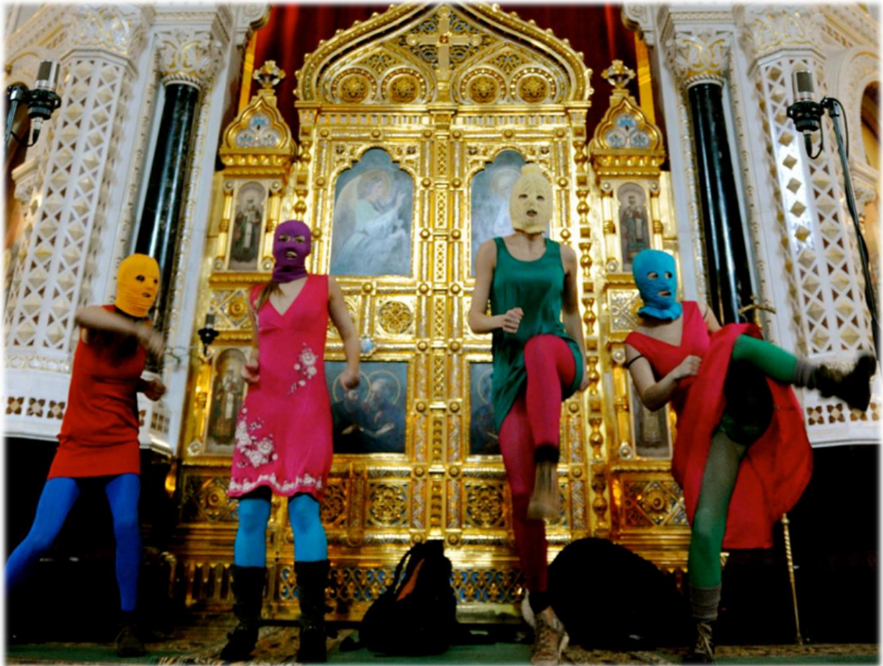
Pussy Riot performing "A Punk Prayer", 2012 18