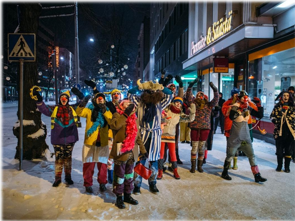
The Loldiers of Odin 57

While CIRCA has been fairly inactive over the last few years, an internet organization called Clownsec keeps the spirit of rebel clowning alive to some extent. Clownsec, as defined by their website, “is the natural evolution of activists, street artists, hackers, phreaks, geeks, pranksters, urban explorers, musicians and various other freedom fighters who show their appreciation for humor in an otherwise dreary world of protest and hactivism.” 58 While they encourage people to “Honk the Planet” and spread a message of lighthearted insubordination, their tone is notably more sinister, freely taking on the image of the terrifying, murderous clown, and encouraging people to participate in ‘direct action’ activism, solving problems yourself rather than petitioning authorities or relying on external institutions. They proselytize personal liberty, expression of self, and participation to whatever capacity in their Clown Army (‘Resistance if Fertile!’). Considering their strong internet presence and ability to spread information anonymously from their screens, Clownsec inhabit a space of vague insubordination which corresponds to the liminal nature of the clown. “This is a radical departure from the confrontation of demonstrators and authority and here are the beginnings