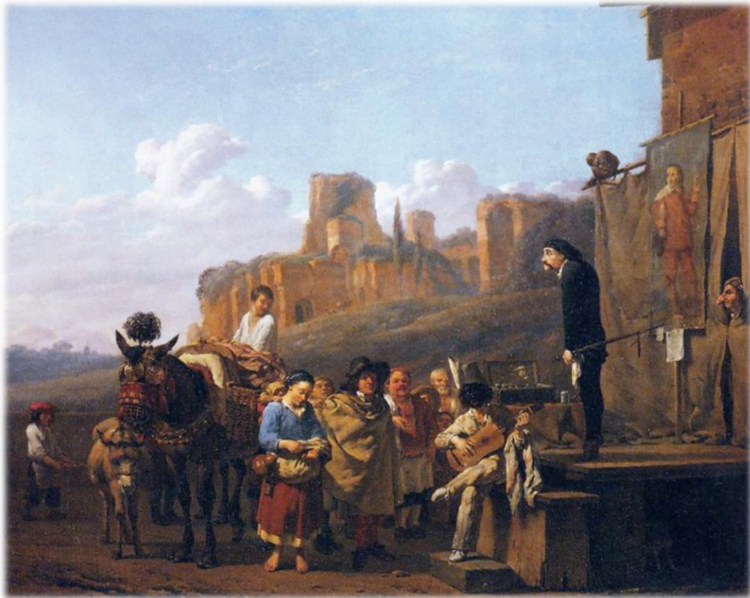
Karel Dujardin, Commedia dell'Arte show (1657)

that the audience can relate to. “You could remove the Fool... and not alter much in the way of plot structures,” says Bloom, “but you would remove our surrogates from these plays, for the Fool... [is the true voice] of our feelings.” 38 Above all, the Fool acts as a contrary to the very idea that the world is ruled by rational structure or that our lives are somehow fated. His mission is to show us that we are all fools.