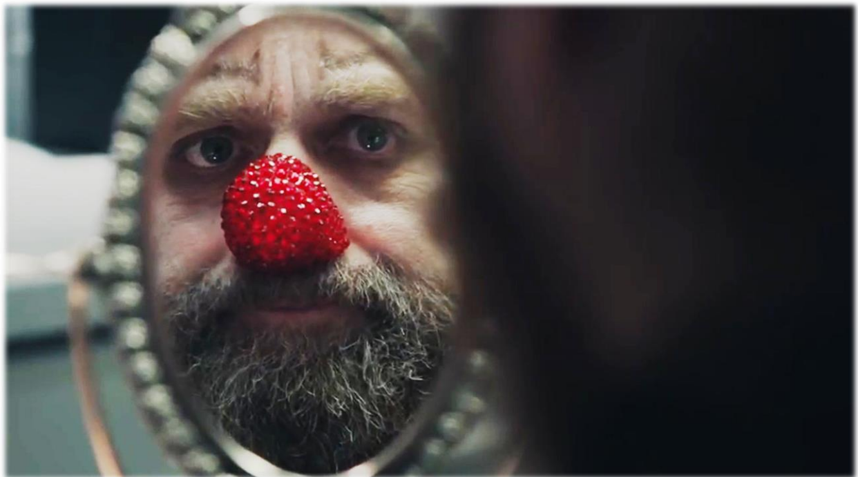
Zach Galifianakis in Baskets , 2016 52

a moment of overwhelming self-realization for Chip, who discovers a newfound passion for parenting and a revitalized hope to sift through the swamp of failure, but it is quickly beaten down by the news that his wife has left to return to France. The show returns to its depressing cycle, with new failures to overcome, but it hints at the spirit of clowning that the show tries to convey: we are all fools, so it is best to laugh at our own shortcomings. While Chip fails at being a clown (failing at failing, a seemingly impossible feat), he shines when he lets himself show his vulnerability and respond to the vulnerability of others.