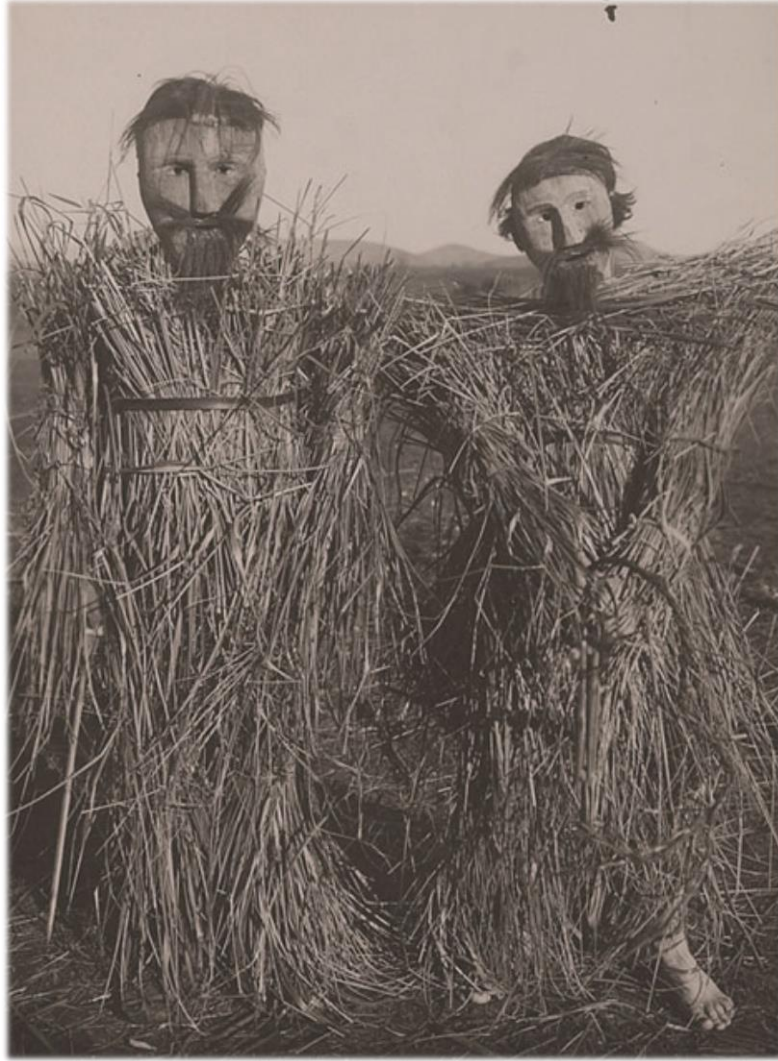
“Kollones.” Two Mapuche clowns in 1928. 26

On the other side of the globe, the socio-religious performance traditions of Bali are perhaps one of the best examples of traditional clowning in a modern social structure. The history of this practice is difficult to trace, but it is ingrained in the Balinese social dynamic and used as a way to express opinion about very real issues affecting Bali, namely westernization. Before electoral politics, Balinese kings would use theatrical performances as a function of religious rituals in order to exert power in the form of moral instruction, spreading concepts of how humans should exist and act in accordance to the gods and nature. Remnants of that