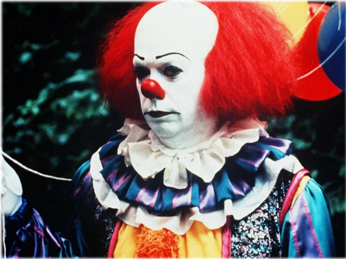
Pennywise the Dancing Clown from the 1990 film It

In these cases, I would say that some of the qualities that make clowns so effective, namely their unpredictable nature and willingness to defy social norms (such as not murdering people in this case), have been exploited to great effect. The element of unpredictability is one that is most obviously applicable to serial killers and other members of society who have atypical moral compasses, so the exploitation of that mysterious nature is a logical step. A clown “transgresses all boundaries, refuses all dichotomies: often neither a male nor female... clever nor stupid, mad nor sane, entertainment nor threat. Ignoring... these oppressive binary oppositions s/he claims the position of the ‘other’ with pride as s/he plays with and against categorization.” 12 That being said, these contradictions can understandably cause anxiety from a lack of familiarity, a fear of the unknown.