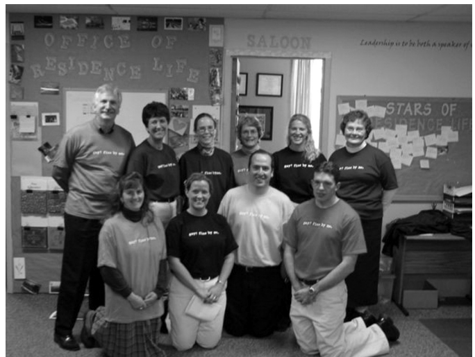
Members of AU's Student Affairs team gather for a photo on National Coming Out Day.