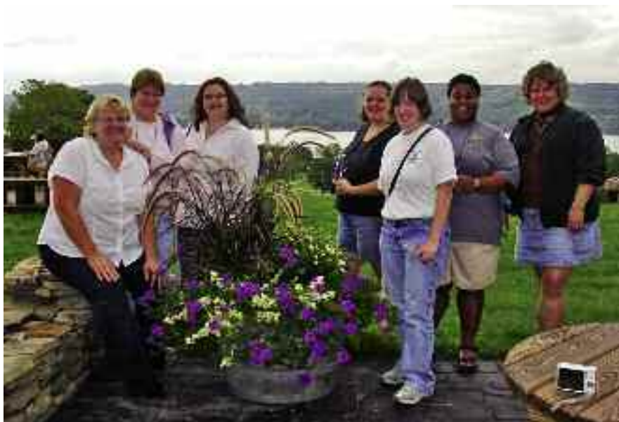
A group of Alpha Kappa Omicron sisters gathered for the Keuka Lake Winery Trail Oktoberfest Sept. 16, 2006. Seven sisters met at Keuka Overlook Wine Cellars and proceeded to taste and tour a total of eight wineries. Luckily, two of the group volunteered to be designated drivers! The scenery was lovely, the wines were very enjoyable plus it was so nice to reconnect with sisters from different eras. See more AKO news on the facing page.