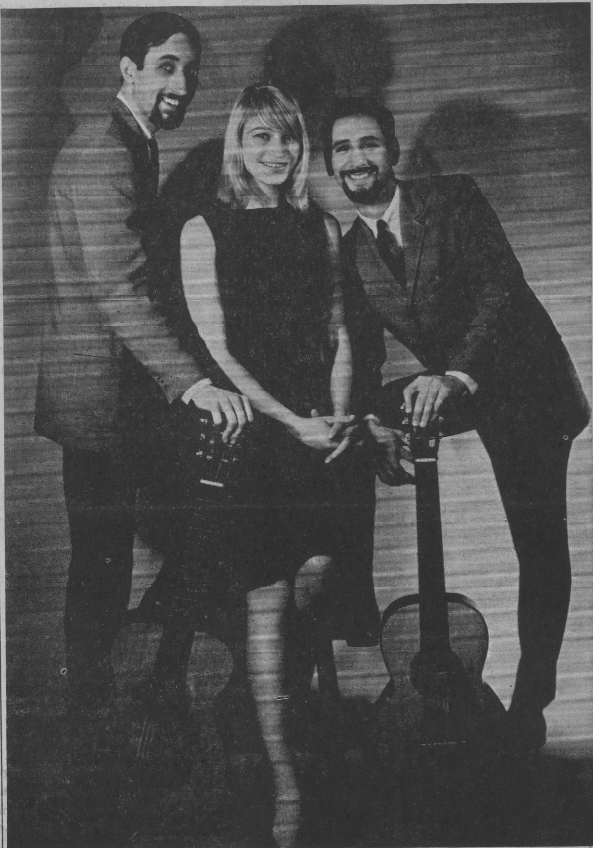
Peter, Paul and Mary

Pyramiding their beer mugs, the six fraternities that make up the Alfred University Interfraternity Council are represented by their official coats of arms on the mugs. From top, left to right, are the crests of Kappa Psi Upsilon, Tau Delta Phi, Delta Sigma Phi, Lambda Chi Alpha, Klan Alpine, and Phi Epsilon Pi.