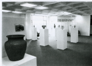
The Charles Fergus Binns Exhibition closes June 14, 1992.