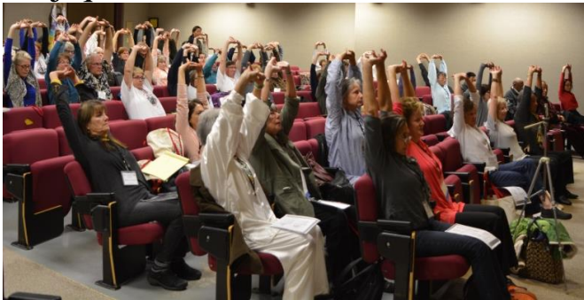
The audience interacting with the speakers