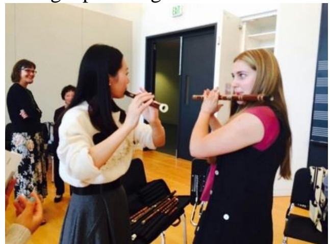
American students trying the Chinese instrument, Dizi