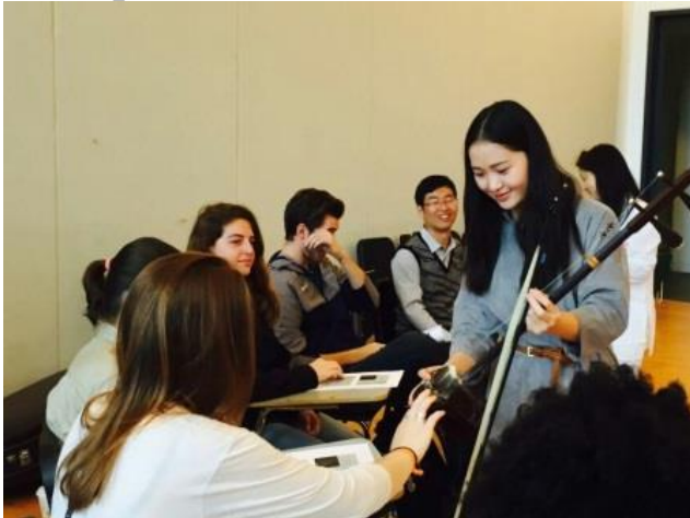
Students communicating with each other about Erhu

The lecture on that day not only brought beautiful music to students, but also provided a chance for the musicians and students to exchange their opinions about music.