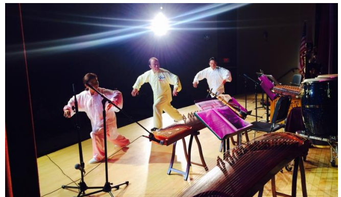
Tai Chi performance accompanied by Chinese folk song

The Tianhan Traditional Chinese Orchestra performed many classic Chinese songs with musical instruments including Erhu (Chinese fiddle), Pipa (Chinese lute), Dizi (Chinese bamboo flute), Guzheng (Chinese zither) and Yangqin (Chinese dulcimer). The audience was excited to see these different instruments and liked the songs very much.