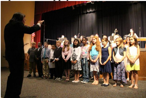
Northstar students at the Mid-Autumn Festival Concert