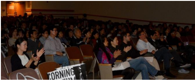
Audience applauding the performance