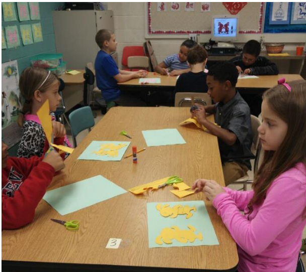
Students cutting out rabbits

organized many activities including paper-cutting rabbits and storytelling to help students learn more about Chinese culture. The rabbits were displayed during the Open House on Oct. 15th.