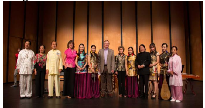
AU president with his wife, the Tai Chi masters, and the musicians