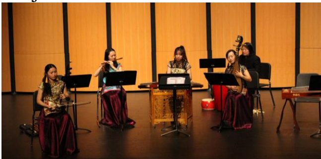
Erhu and ensemble performance