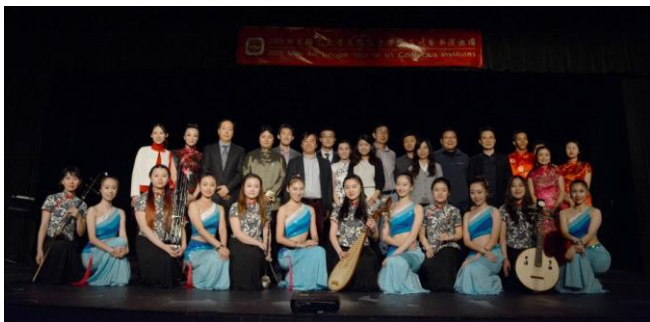
Group photo of both audience and performers

The performers from Nanjing gave a musical treat to the community of Corning. What's more, this concert concentrated on the culture of traditional Chinese folk music which helped the local audience to know more about traditional Chinese instruments. More than 600 people attended the concert and had fun there.