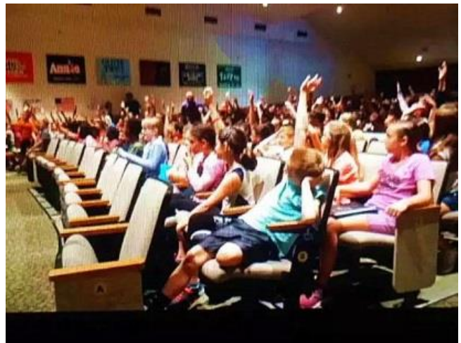
Students interacting with Chinese musicians

On September 24, Tianhan Traditional Chinese Orchestra arrived at North Syracuse. They gave two marvelous performances for the teachers and students at Gillette Road and Roxboro Road Middle Schools. The varied programs, which included the famous traditional pieces “Strolling in Suzhou”, “Grapes Harvest”, and “Moon over the Peaceful Lake in autumn”, Peking Opera, and an introduction to Chinese musical instruments, amazed the audience, which responded with lots of applause. More than 400 students enjoyed the demonstrations. One student told his teacher after the performance, “I feel so calm when I hear the ‘Moon over the Peaceful Lake’.” The performance on that day was a big success, and many students asked for the musicians’ autographs afterward.