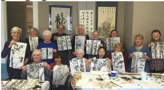
Students showing their work

Most of the students in our painting class are returning students. We also have two new students coming all the way from Rochester to join our class. They are really happy that each time they can bring home an artwork done by them. We have a great time getting together each week.