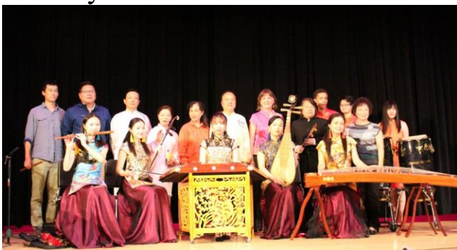
Group photo of musicians and CIAU faculty

On September 25, the Confucius Institute at Alfred University held a traditional Chinese music concert in the auditorium of Gates Chili High School in Rochester to celebrate the Chinese Moon Festival. The Tianhan Traditional Chinese Orchestra, which belongs to the grand Tianhan Theater, faculty from the Alfred University Division of Performing Arts, three Tai Chi masters, and nineteen lovely students from Northstar Christian Academy presented a visual feast and auditory for the audience.