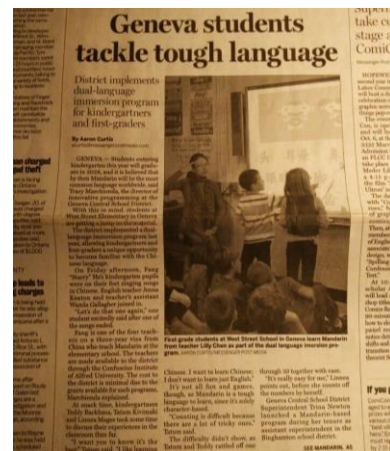
Report on the Mandarin Immersion Program

The Mandarin Immersion Program became positive news in the local community, as it attracted local TV stations and newspapers to report on the program. We also did many activities to promote cultural and artistic exchange in the Geneva School District.