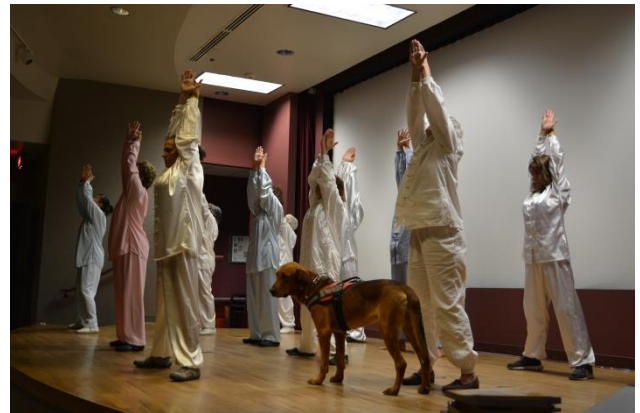
Alfred Tai Chi class members showing the Swimming Dragon

On the second day, the Confucius Institute invited both the Chinese and American Tai Chi masters and others to introduce more about Tai Chi culture and Chinese medicine. Some volunteers came to the stage to experience acupuncture. It is worth mentioning that the Confucius Institute Tai Chi class members performed the Swimming Dragon exercise and Twenty-Four Steps for the audience.