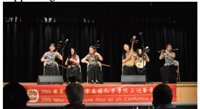
Nanjing Normal University Art Troupe performing