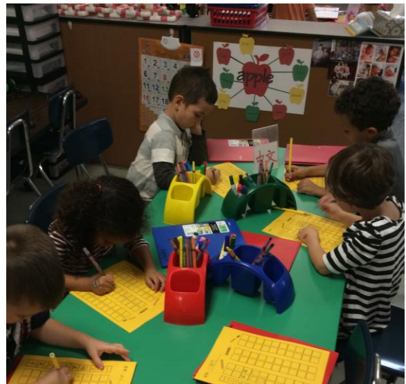
Students writing numbers in Chinese during the Center time

learning activities with these beginners. Her students learned Chinese songs and rhymes, read Chinese story books, watched Chinese cartoons, and made Chinese books. Besides, Starry tried to teach students math in Chinese, including counting, measure words, and written numbers.