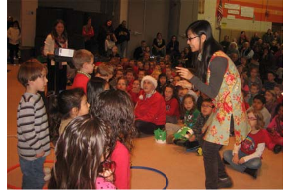
Students are performing the Chinese song at PAWS night at West Street Elementary School

method, colors, Chinese pictography, and Peking Opera through various activities. Fourth graders had discussions on peace, the Constitution, and law in the history of Native Americans, with some famous Chinese historical figures being introduced at the same time. The fifth graders discussed the themes of fairness and human rights through a comparison between America and China, which provided the students with a better understanding of Chinese history and the current situation of social justice, in addition to the concept of human rights in China. Moreover, both fourth and fifth graders learned Halloween and household vocabularies in Chinese.