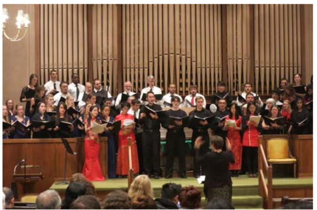
CIAU faculty and AU singers are performing a Chinese song