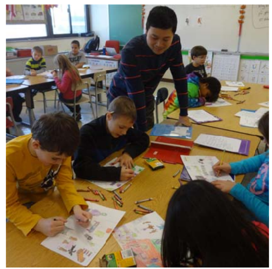
Students at North Street Elementary School are designing their dream house