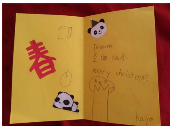
A handmade gift card by a student