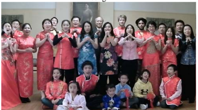
CIAU faculty are wishing happy New Year to the whole world